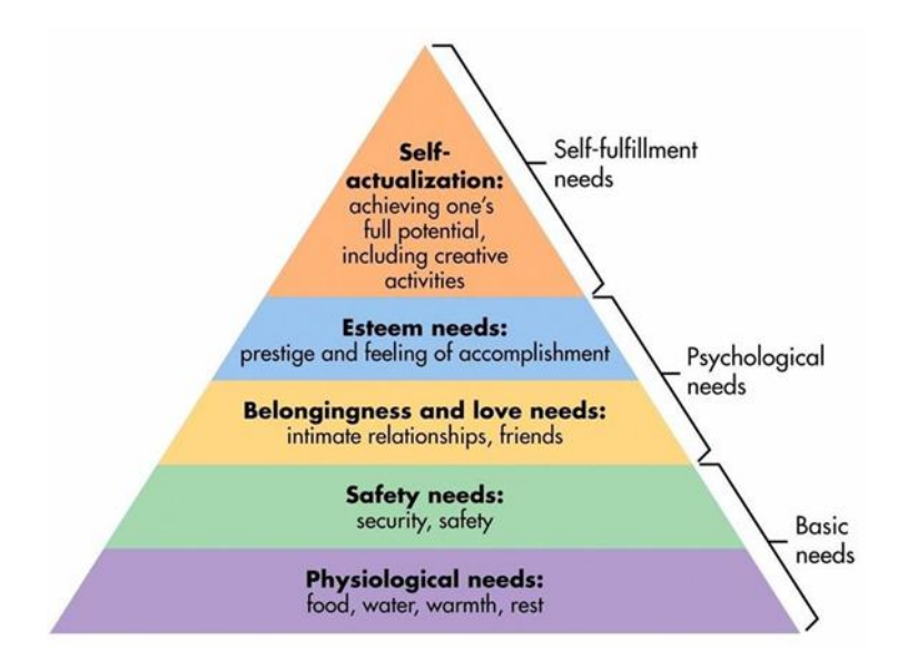
Figure 1. Maslow's Hierarchy of Needs (Maslow, 1943)

In this study, the needs of children of sex workers have been examined using Abraham Maslow's hierarchy of needs theory. In the previous studies of the children of sex workers, researchers looked at how disparities are reflected based on the satisfaction of people's fundamental needs and discovered that the inability to access basic requirements frequently results in low levels of self- esteem. They might then turn to violence, drug abuse, and criminal activity as a result.