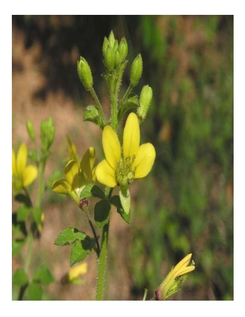
Figure 2: Fruits and Flowers